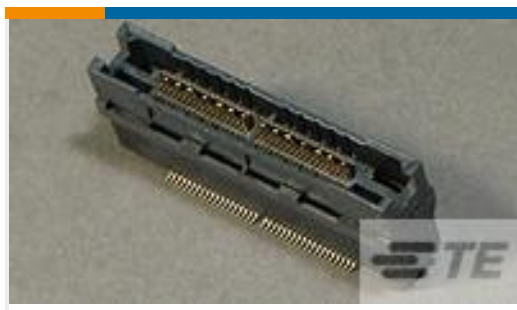
TE Part # 5767154-2 76 POS. .355 VERTICAL RECEPTAC