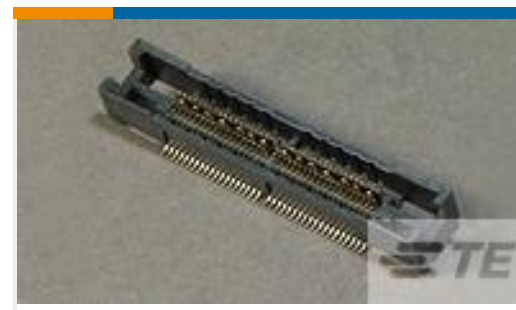
TE Part # 5767181-2 MICT,RECPT,76,ASSY,PDNI