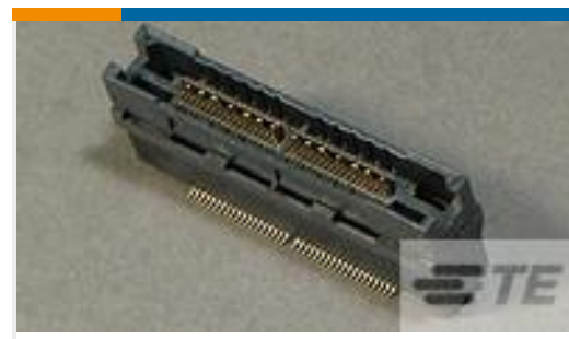
TE Part # 5767178-2 MICTOR .355 RECEPTACLE, 76 POS T&R PACKA